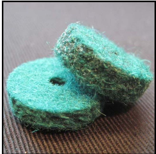
Thinnest and thickest front rail punchings.

Keybed felts come in a range of thicknesses, so that the original size of the felt installed at the factory may be duplicated. Paper and card punchings as thin as .002" are used under the felts for final adjustments necessary for level keys and even key dip.