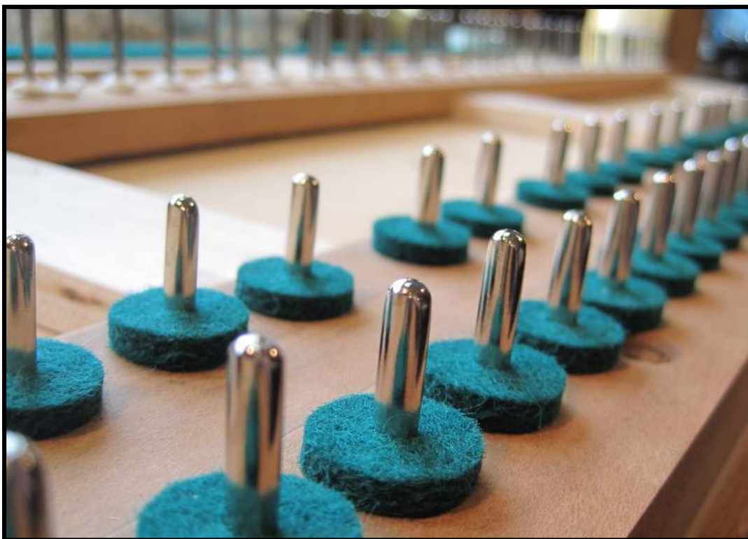
New set of keybed felts in place.

"In business to bring your piano to its full potential."