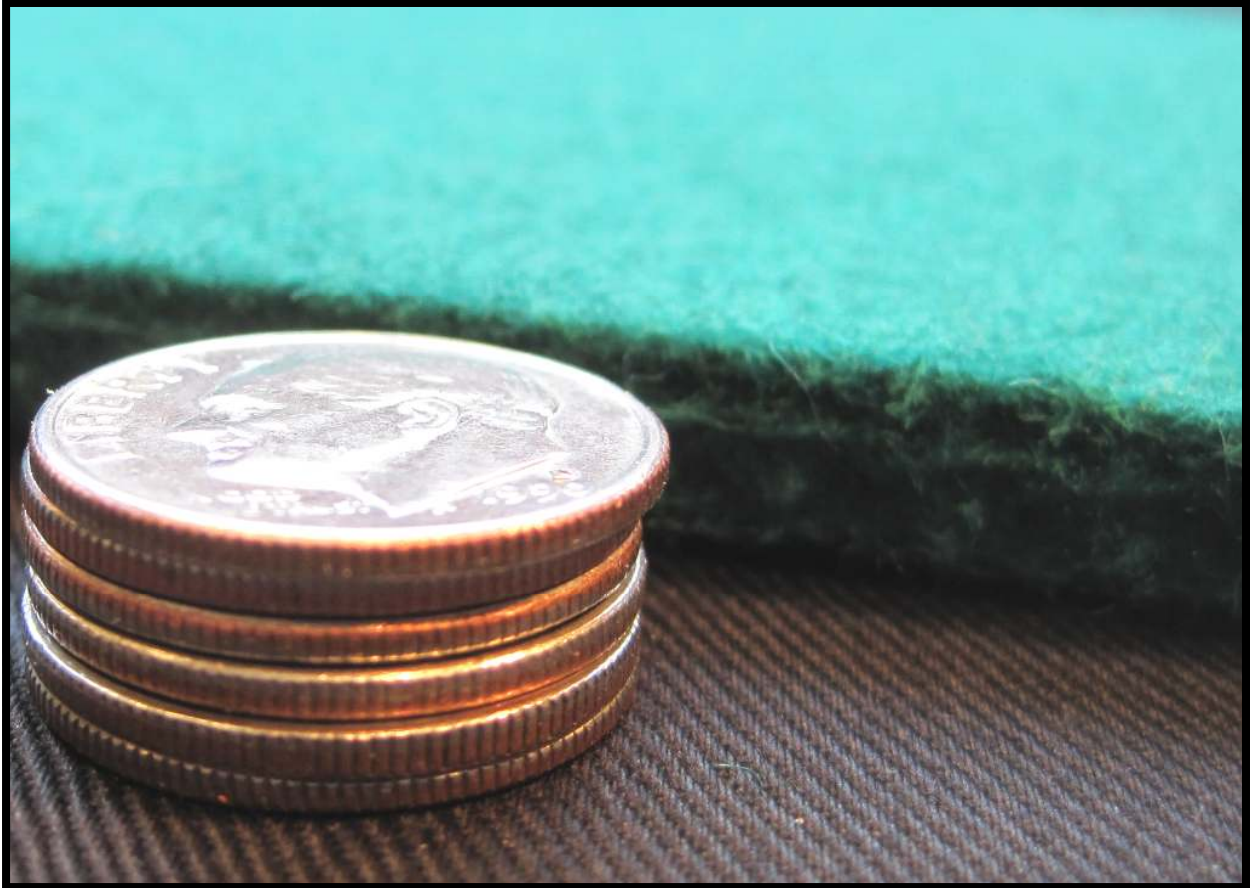
The thickness of heavy backrail cloth equals that of six dimes.

Very much so. As illustrated in the photo above, the felt used for backrail cloth (as well as balance rail and front rail punchings) is a very thick, dense felt that is designed to stand up to decades of constant use.